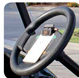
Comfort Grip Steering Wheel