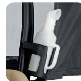
Divot Repair Sand Bottle