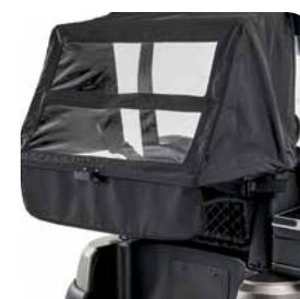
Bag Cover with Magnetic Latch