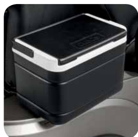
Caddy Master Cooler