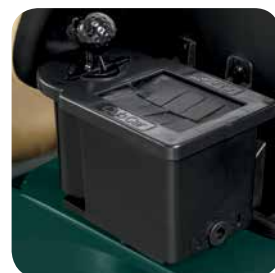
Ball and Club Cleaner