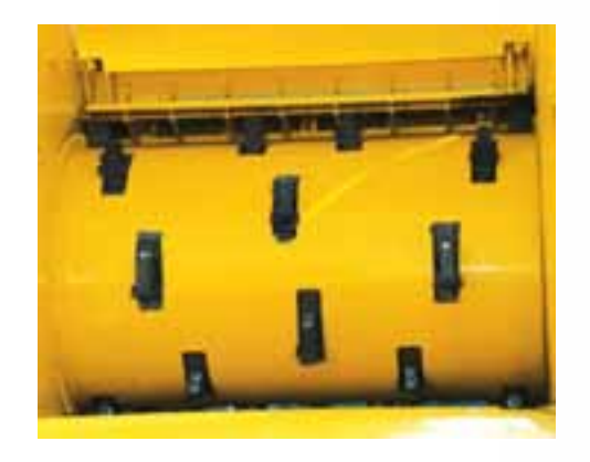
Series II duplex drum With reversible hammers and cutter blocks, this drum offers nearly double the life of

The HG6000TX features a Vermeer track undercarriage with 20"- (50.8 cm) or 24"- (61 cm) wide double-grouser track pads using sealed track rollers and compressed coil springs to provide protection against debris buildup in the track system.