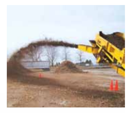
The HG6000Tx blower system is designed for use in clean wood applications. This optional blower features 140-degree rotation and tilt adjustment via remote control to distribute processed material over a large area or into the rear of a chip-hauling trailer. The blower features a heavy-duty impeller assembly with replaceable wear plates and convenient service access.