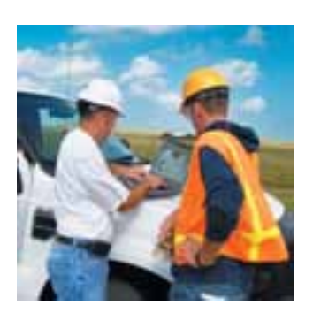
With nearly 200 locations across the globe - you're never far from an independent, authorized Vermeer dealer. Our dealers are in place to support your success with product expertise that's second to none.