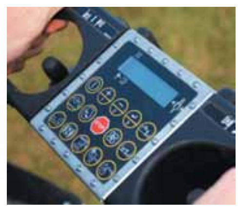
State-of-the-art wireless remote control units allow the operator to run most machine functions away from the machine. Remote controls are nontethered with a maximum working range up to 300' (91.4 m).