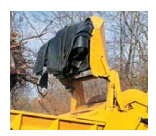
The innovative HG6000 / HG6000TX features the Thrown Object Deflector (TOD). The TOD reduces the quantity and distance of thrown material debris. Additionally, the TOD is strategically positioned to reduce interference when loading over-length material.