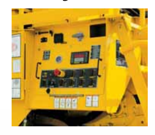
The standard microprocessorcontrolled HPTO clutch is designed to control the starting sequence with the push of a button — no need to bump a clutch. Minimal operator interface is required to initiate the grinding process.