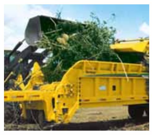
The patented SmartGrind system and hydraulic feed roller down pressure keep material moving so that loading speed and productivity are maximized. Open-ended, wide feed tables are designed to make over-the-side loading easy and efficient.