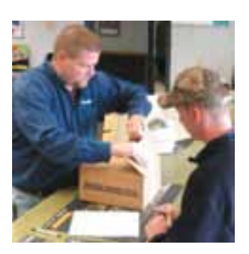
Vermeer parts are designed and manufactured to original specifications, so whether they're new parts or replacement parts, they'll live up to the Vermeer name.