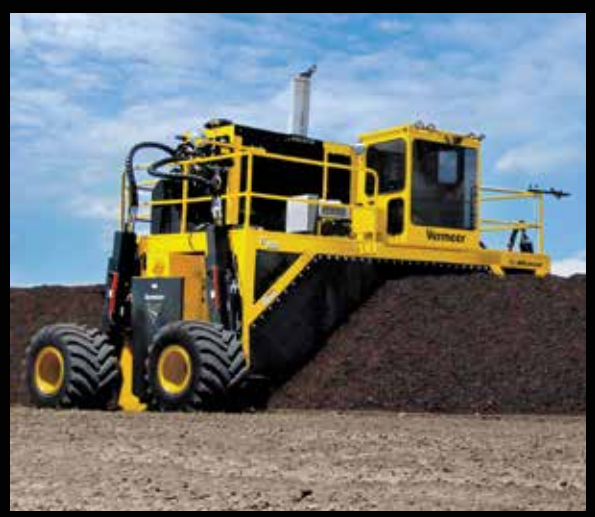
Both elevating-face and drum-style configurations define the Wildcat by Vermeer line-up of compost-turning equipment.