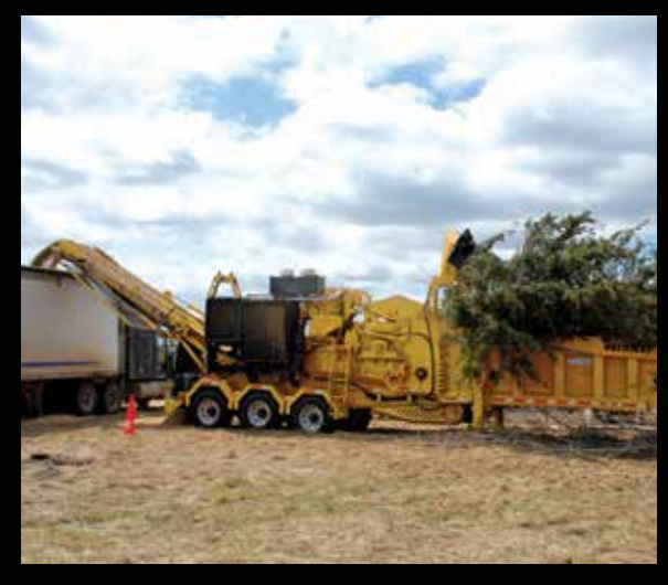
Available in both trailer-mounted and track-driven configurations, Vermeer horizontal grinders offer the industry-recognized SmartGrind feed system and the serviceability-minded duplex drum standard.