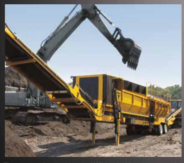
The operator-inspired group of Wildcat by Vermeer trommel screens offers a range of options to fit your needs and