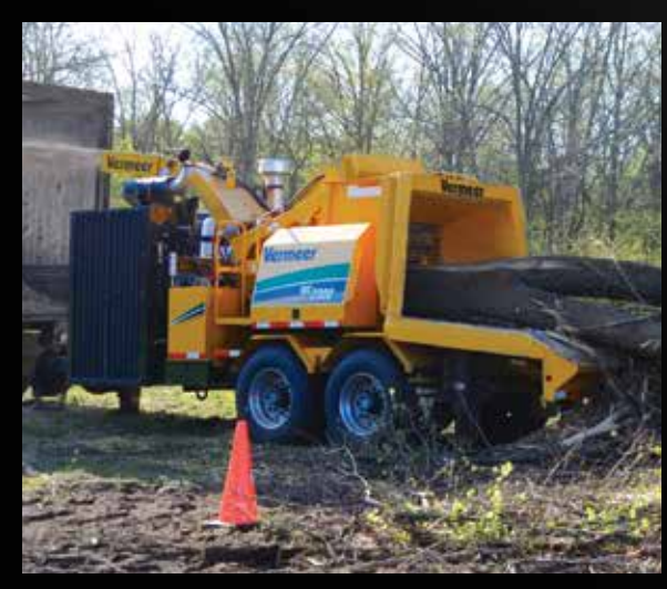
Backed by decades of market experience, Vermeer offers the industry's largest and most diverse line of tree-focused solutions, including brush chippers, stump cutters and whole tree chippers (shown).