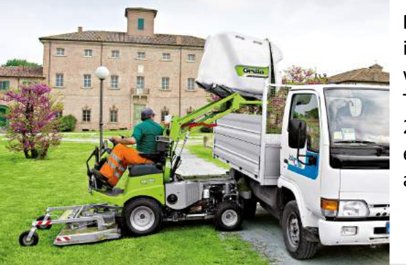
FD 13.09 has a great cutting and collecting capacity; it is unmatched in extreme conditions with high or wet grass.

The grass box has an excellent discharge height, 200 cm of height and 30 cm of rear overhang, enabling the user to easily empty the grass box into a truck or container.