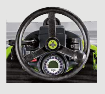
An electronic control unit and several sensors guarantee the safety of the machine.