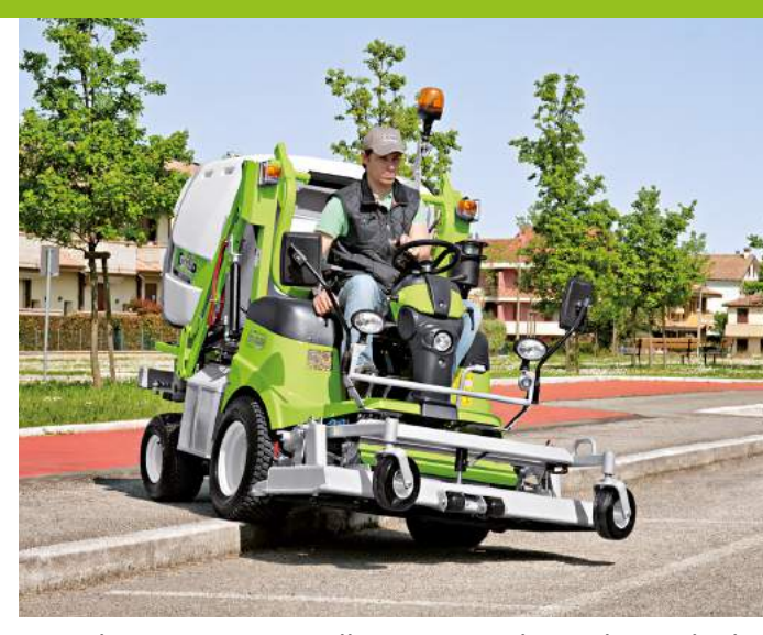
Its agility, its ease travelling over curbs make it ideal for the maintenance of road flower beds and round-abouts.

FD 13.09 is also ideal for collecting leaves.