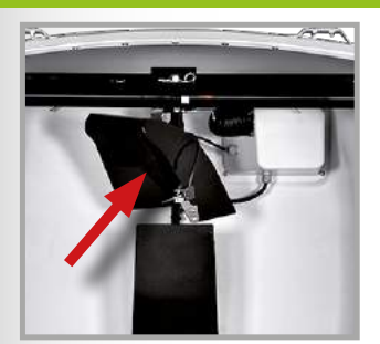
mobile grass distributor