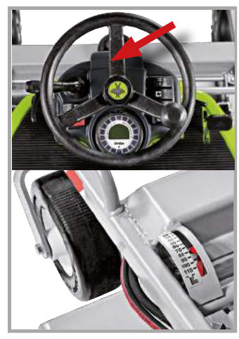
hydraulic assisted and continuous cutting adjustment

FD 13.09 can be equipped with two kinds of mower deck, 132 cm or 155 cm with collection and mulghing kit. Both cutter decks are centre-positioned, extremely robust and transmission via cardan joint with oil-bath angle gearboxes.