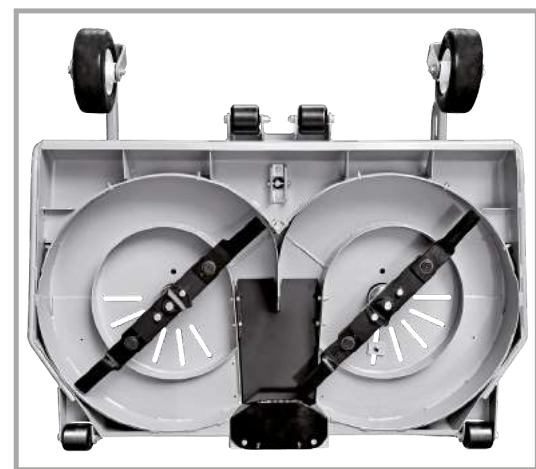
Mulching kit as a standard feature on cutting decks with collection