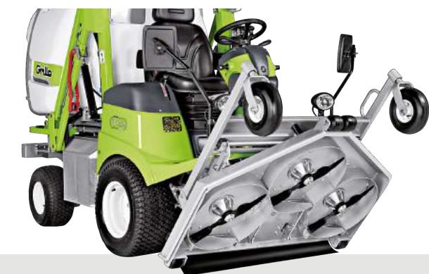
Mulching/Rear discharge Cutting change operated via an electrical switch