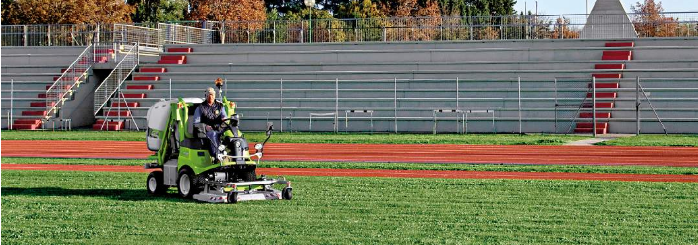
FD 13.09 is unequalled in the maintenance of school gardens, public parks, sports facilities, camping, riding areas ... anywhere you need both a nice and efficient cleaning.