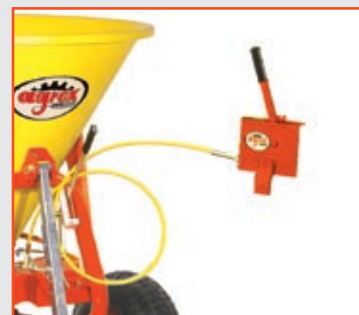
Mechanic remote control.