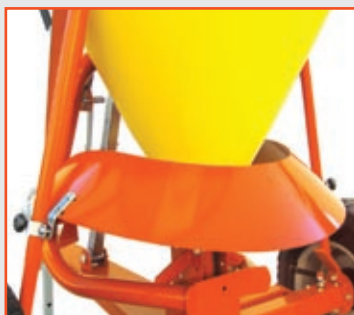
Deflector for salt/sand.