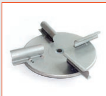
Stainless steel spreading disc.