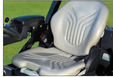
Air Ride Seat | 30511