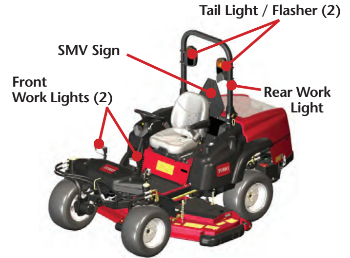
Road Light Kit | 30513 (non-cab models)