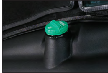
Diesel Fuel Cap (green) | 107-2172