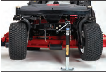
Jack Stand | 30579