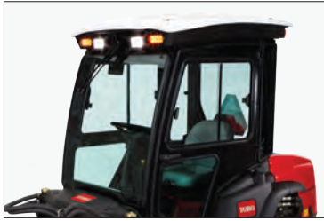
Removable Winter Enclosure | 31220