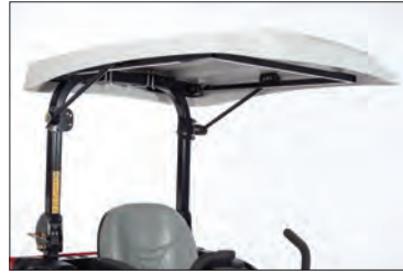
Universal Sunshade | 30349