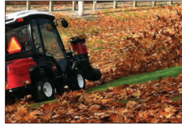
Pro Force® Debris Blower | 44547