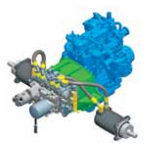
The integrated direct-drive transmission reduces maintenance and improves durability.