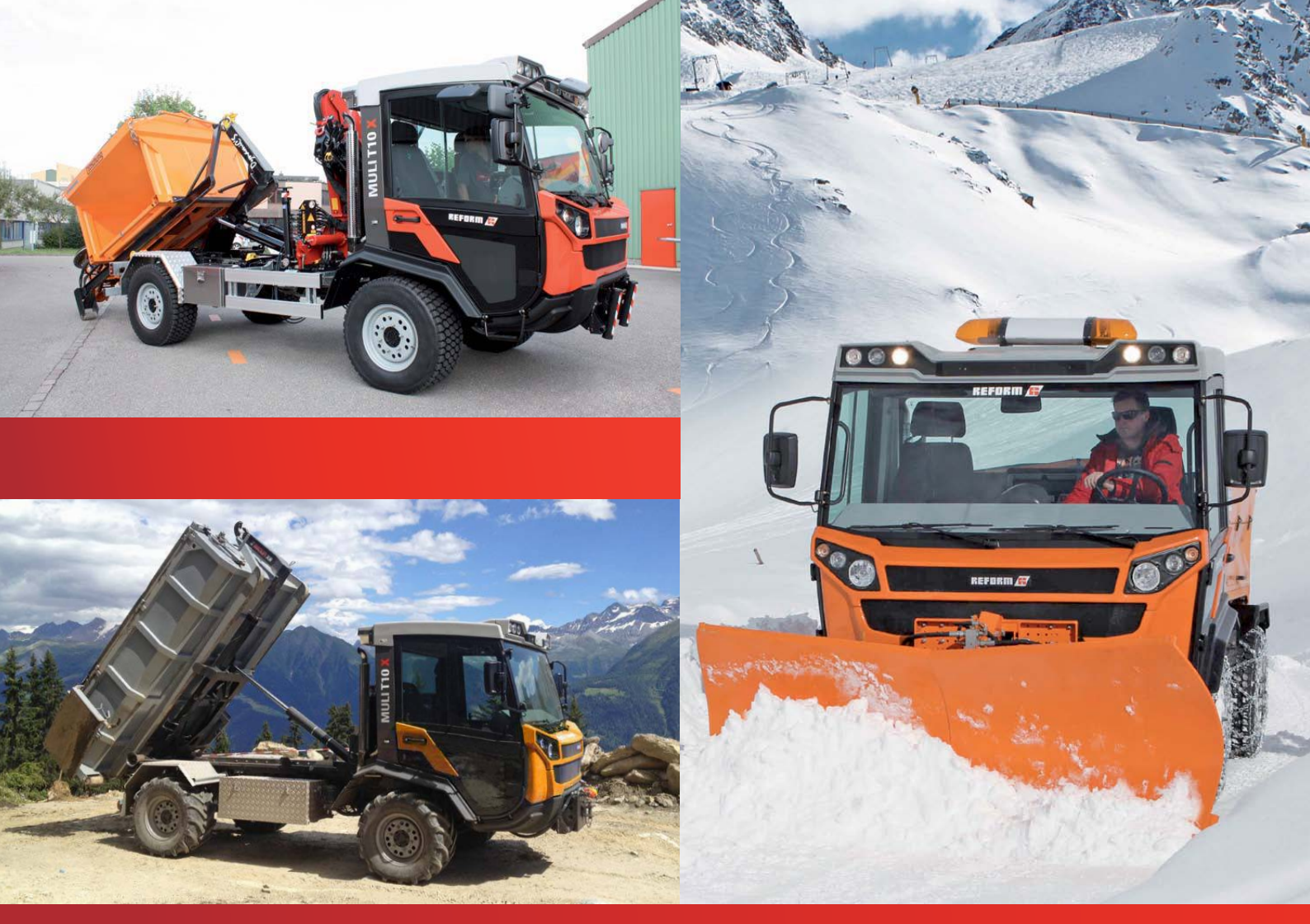
The all-rounder ...