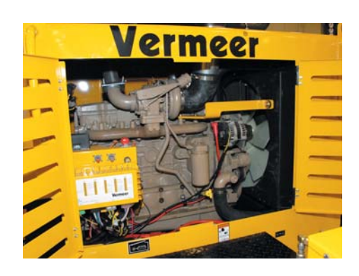
Three Cummins diesel engine options to match most jobsite needs. Options include 215 hp (160.3 kW), 250 hp (186.4 kW), or 275 hp (205.1 kW).