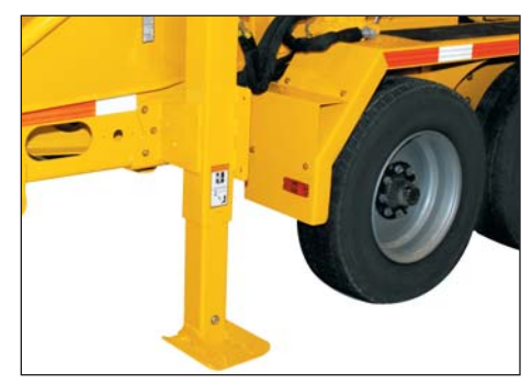
Optional hydraulic outriggers support the back of the chipper and prevent the unit from bouncing while chipping or loading large-diameter material onto the feed table.