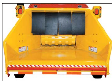
The infeed table design is the largest in its class! It funnels material to the drum opening, allowing for smooth material feeding from table to drum. The overall table width is 72" (182.9 cm) with a 39" x 62" (99.1 cm x 157.5 cm) opening by the infeed curtains and a drum opening of 21.5" x 28" (54.6 cm x 71.1 cm).