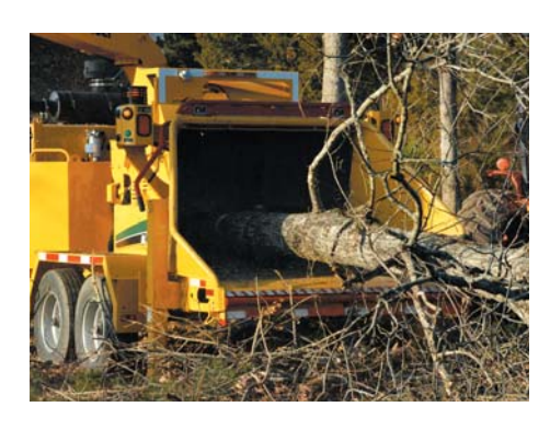
SmartCrush puts the pressure on branches. Once the upper feed roller raises for four seconds, it will automatically increase down pressure on the material being fed. This allows the upper feed roller to easily climb onto large forked material before the increased down pressure is applied for maximum pulling force.