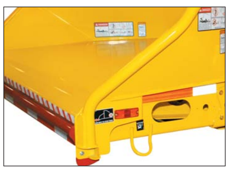
Bottom feed stop bar is strategically located to make it possible for the operator to strike the bar and shut off the feed either intentionally or automatically in an emergency situation. A reset button on each side of the infeed housing allows for easy system reset if the bar is tripped.