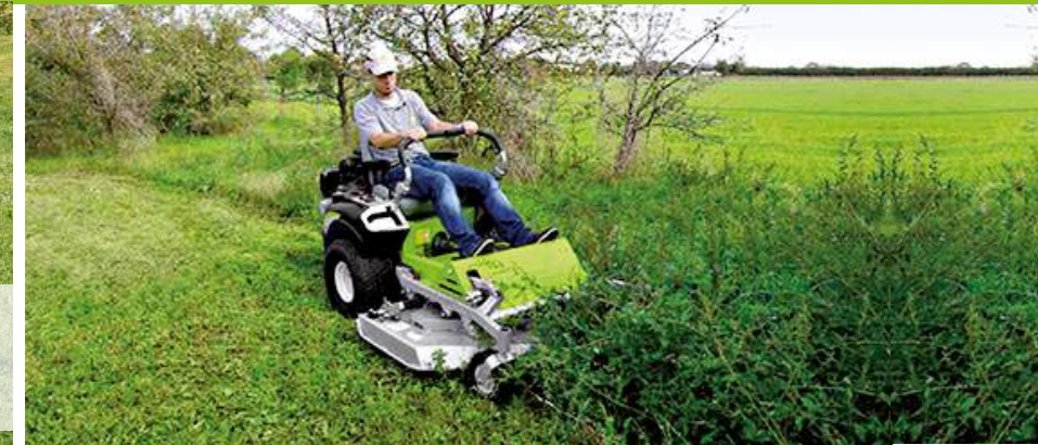
The FX 27 is a mower really suitable for any kind of ground thanks to its quick and easy selection of cutting functions.

The switch from rear discharge to mulching is centralised and quick. A lever allows the operator to choose the most suitable cut without having to leave their seat. The deck is activated by an electromagnetic clutch and is equipped with three blades giving a working width of 125 cm.