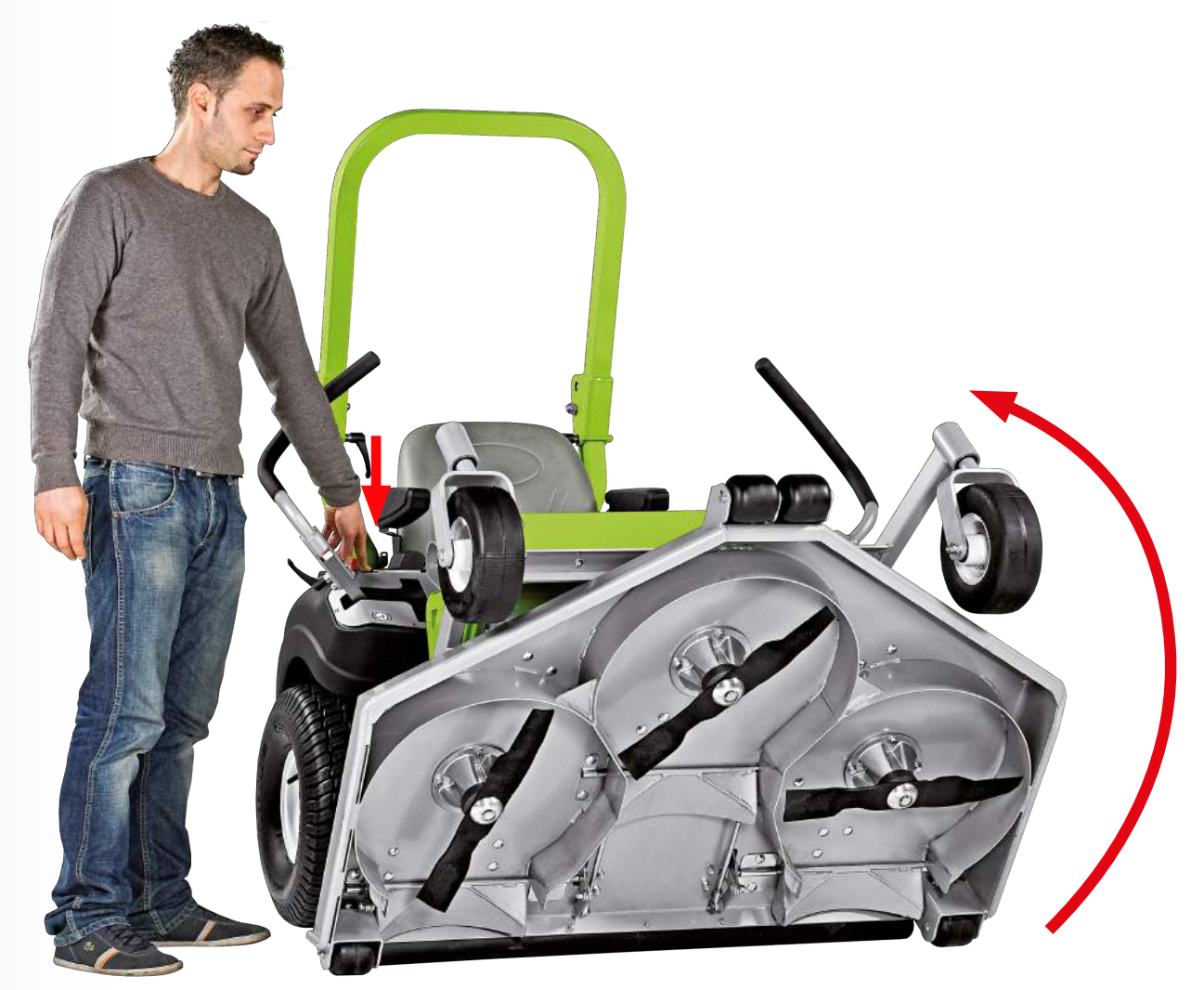
Cleaning the deck in its raised position is quick and easy.

Anyone can easily carry out maintenance on the FX 27 cutter deck. It can be raised into the maintenance position via a push button without even removing the belt.