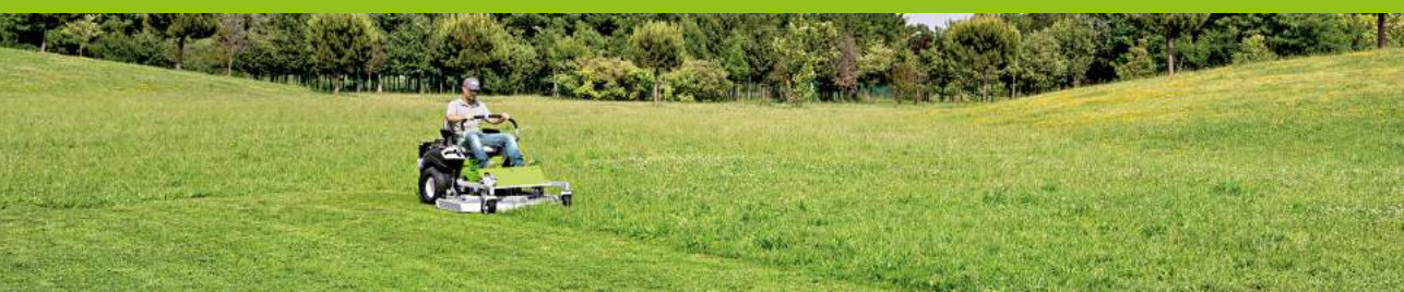
The FX 27 is suitable for large areas where a high quality mulch cut is required. The cutter deck will produce an excellent finish even at high speed, making it possible to cut large areas very quickly.