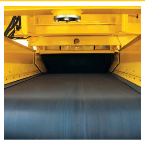
Undermill conveyor. A smooth, 60" (152 cm) belt enables high-volume product removal. To resist tear and puncture, the conveyor is constructed of .5" (1.3 cm) thick rubber belt.