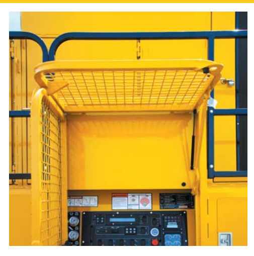
Fallen Object Canopy. For enhanced operator safety, the Fallen Object Canopy helps protect operators from falling debris while positioned at the control panel.