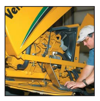
Vermeer offers factorycertified training programs to its dealer network to ensure that the most current service procedures are presented to the service personnel of your Vermeer dealer.