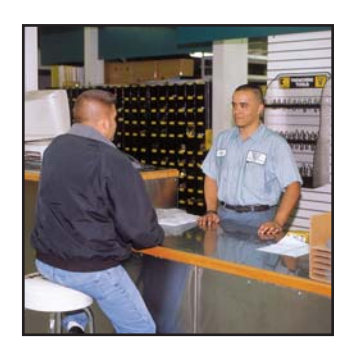
Get the parts and service edge. In addition to providing quality equipment, Vermeer delivers top-quality parts and superior services. Vermeer parts are manufactured to exacting specifications to help keep your Vermeer equipment running trouble-free and at OEM specifications.